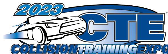
EXHIBIT SPACE APPLICATION Saturday, May 6, 2023, 11:30am-1:30pm

Please direct inquiries to: Northwest Auto Care Alliance (NWACA) 7403 Lakewood Drive W #7 Lakewood, WA 98499